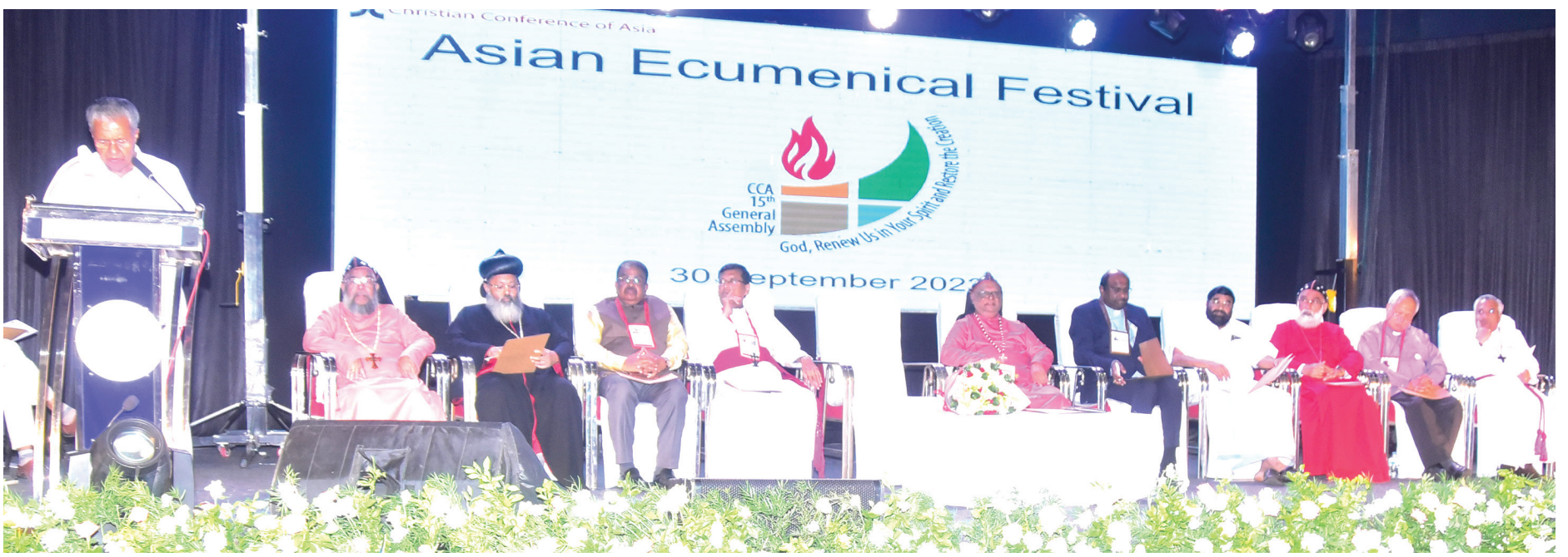
Chief Minister Pinarayi Vijayan Inaugrating the Asian Ecumenical Festival.