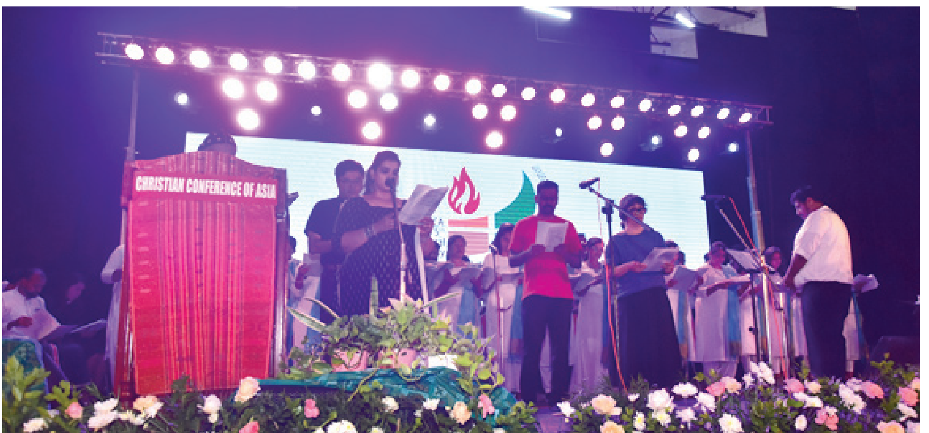
Prayer of Confession in the opening worship