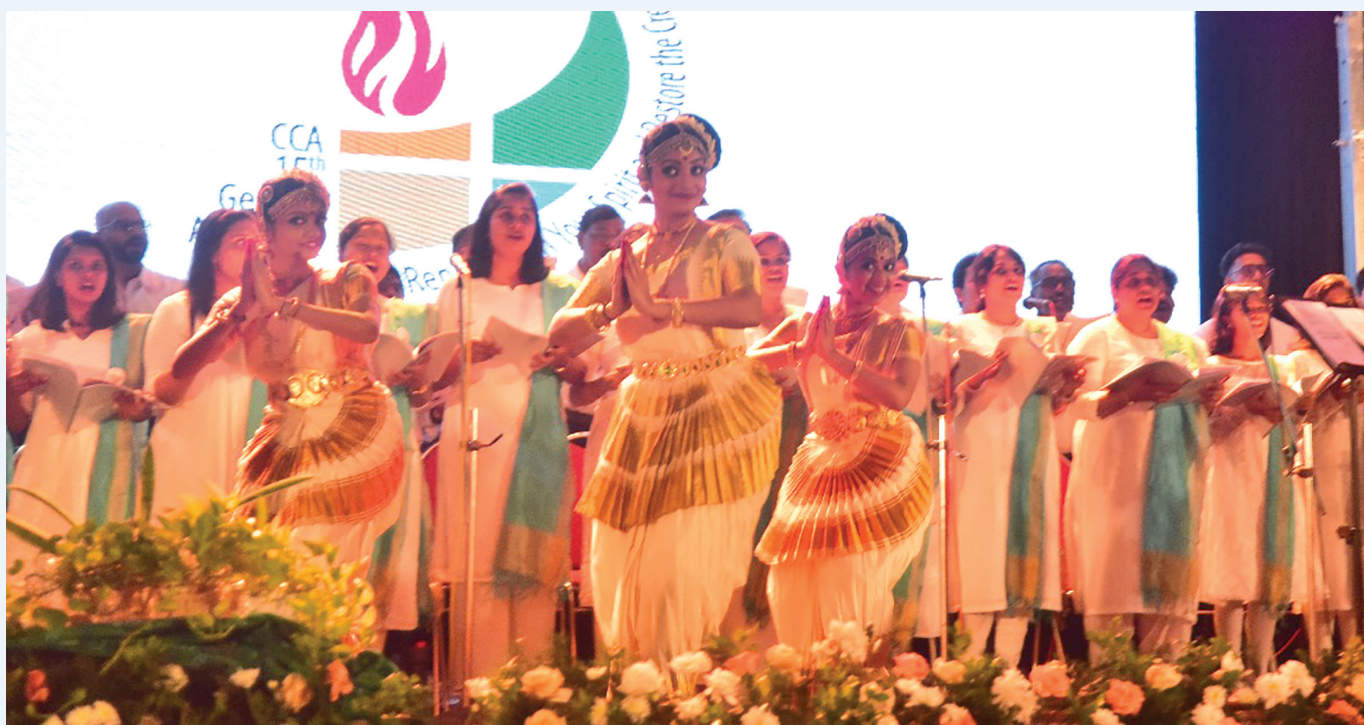
Opening worship presentation in Mammen Mappila Hall