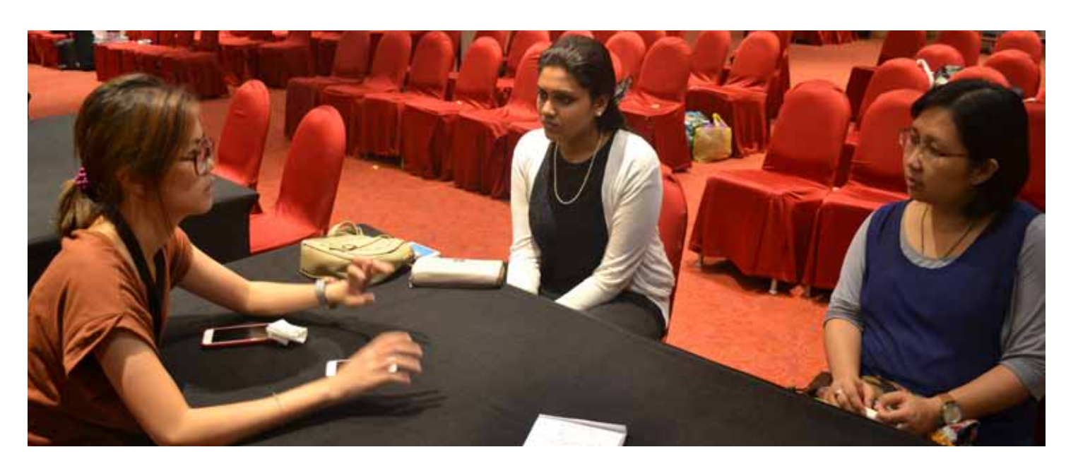
By Ismael Fisco, Jr.

In the assembly represented mostly by the elder leaders of the church, it brings a fresh wind to hear young people share their stories of struggles and aspirations for the church. Not only because they are often marginalized but because the church owes it future to the younger generation.