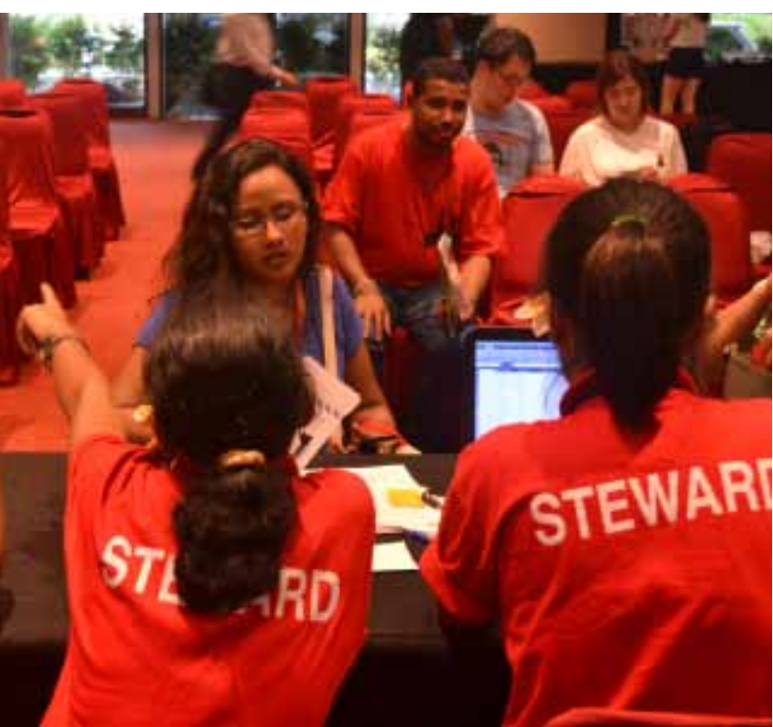
By Ismael Fisco, Jr.

They stand in the side lines of busy assembly assisting delegates with their every need and making sure that everything is in place. They don't have "super powers" but they are oozing with energy and their enthusiasm is just encouraging.