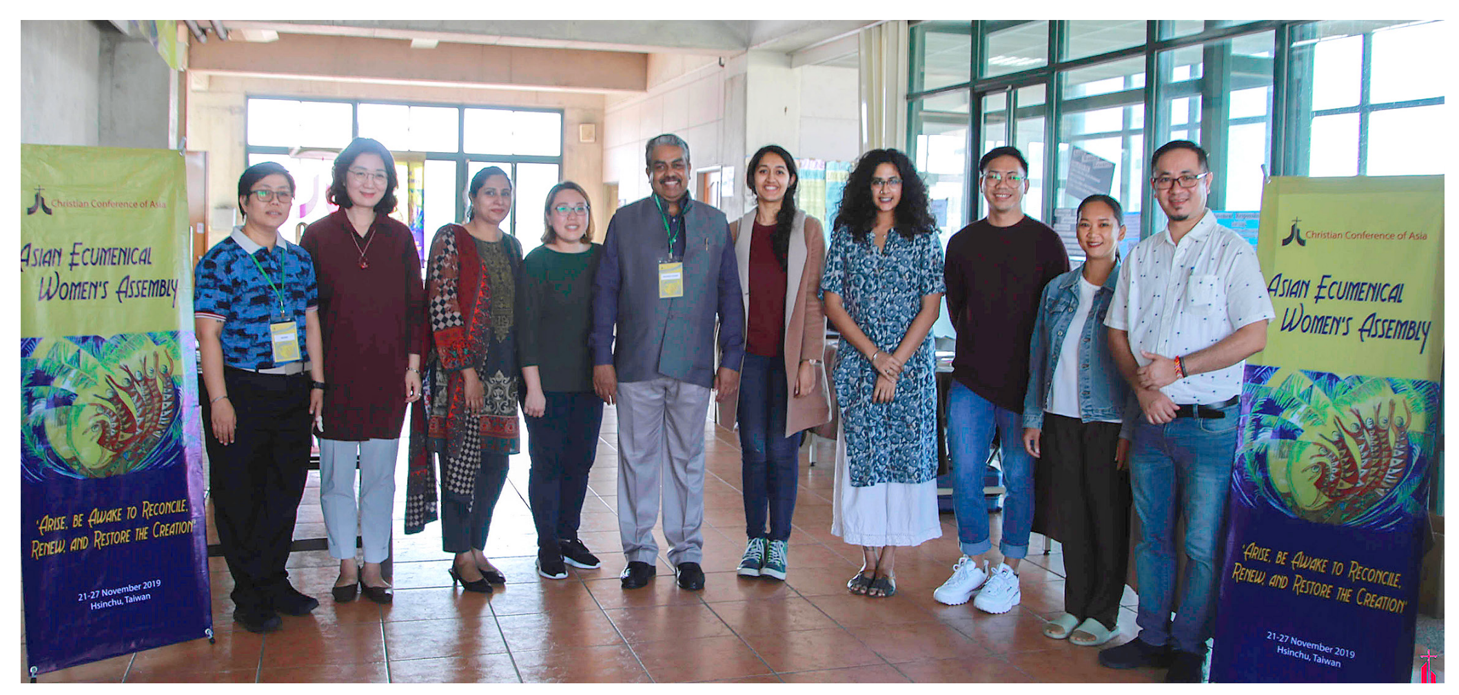
CCA Staff members at AEWA