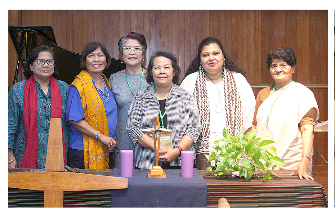
Former CCA Staff attending AEWA 2019