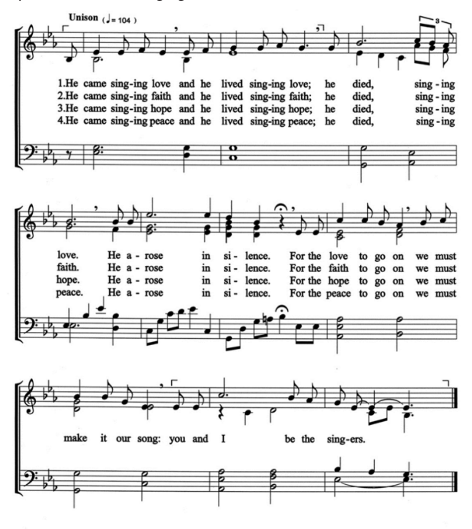
Hymn ... He Came Singing Love