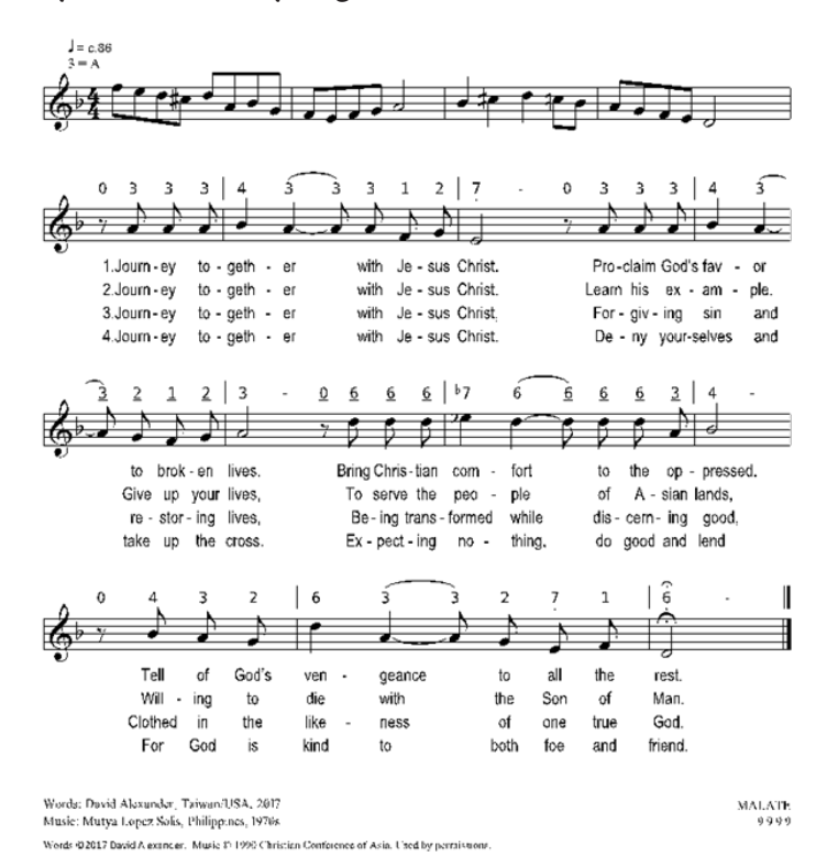
Hymn ... Journey Together with Jesus Christ

God, our reformer! As we worship you, help us feel your shared presence, knit us together more tightly and motivate us to practise inclusivity and accessibility in our journey. We pray, in the name of the triune God, who inspires and reforms the whole creation. Amen.